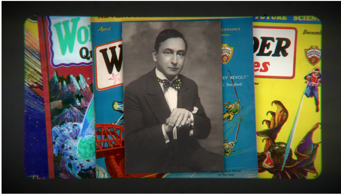
Tune Into the Future by Eric Schockmel

Tune Into the Future by Eric Schockmel (Samsa Film) has been selected at various festivals including Imagine Science Festival, Utopiales, Sydney Science Fiction Film Festival, 13th Annual Imagine Science Film Festival, and many others.